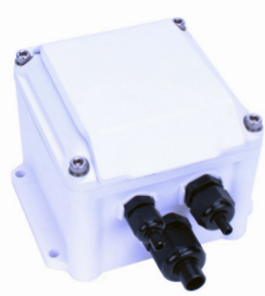
Optional Protective Cover Closed